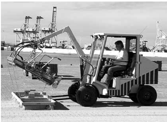
Figure 11. Sweeping jointing sand across the pavers is done after the initial compaction of the concrete pavers.

Coordination and Inspection—Large areas of paving are placed each day and often require inspection by the engineer or other owner's representative prior to initial