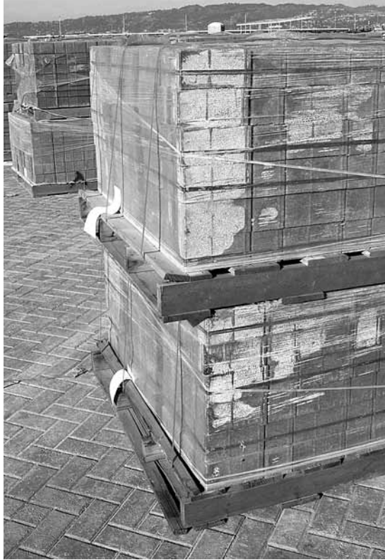
Figure 2. Bundles of ready-to-install pavers for setting by mechanical equipment. Bundles are often called cubes of pavers.

consulted for additional information on design and construction with this paving method. Other references will include American Society for Testing and Materials and the Canadian Standards Association for the concrete pavers, sands, and joint stabilization materials, if specified. Other subcontractors or the GC provides the base, drainage, and earthwork.