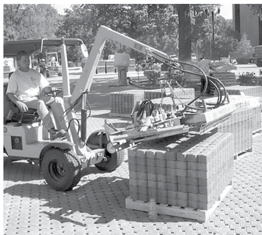
Figure 1. Mechanical installation of interlocking concrete pavements (left) and permeable units (right) is seeing increased use in industrial, port, and commercial paving projects to increase efficiency and safety.