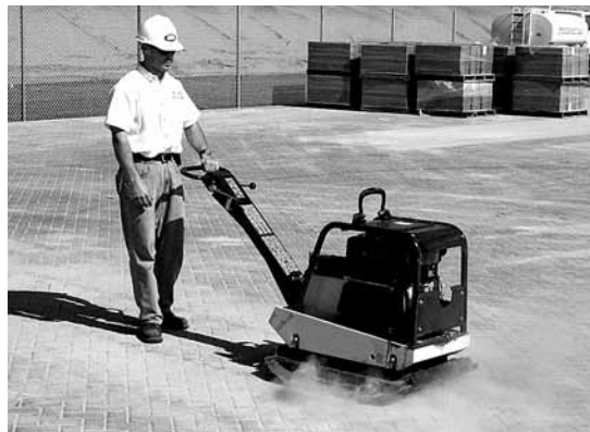
Figure 12. Final compaction should consolidate the sand in the joints of the concrete pavers.