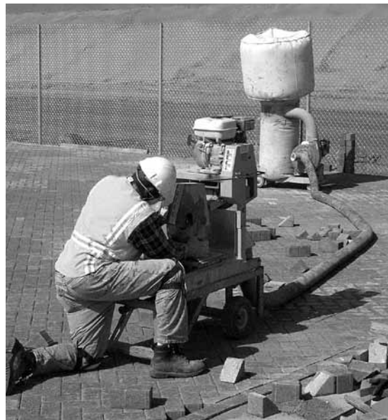
Figure 8. Edge pavers are saw cut to fit against a drainage inlet.