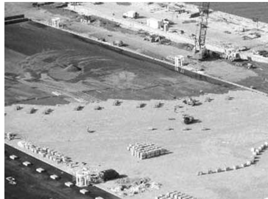
Figure 7. Maintaining an angular laying face that resembles a saw-tooth pattern facilitates installation of paver clusters.

Whenever possible cut pavers exposed to tire traffic should be no smaller than one-third of a full paver and all cut pavers should be placed in the laying pattern to provide a full and complete paver placement prior to initial compaction. Coursing can be modified along the edges to accommodate cut pavers. Joint lines are straightened and