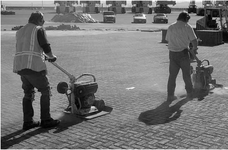
Figure 9. Initial compaction sets the concrete pavers into the bedding sand.