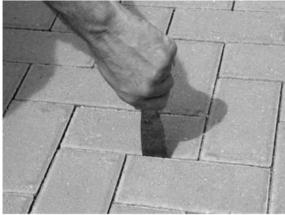
Figure 13. A simple test with a putty knife checks consolidation of the joint sand.

the longitudinal and cross slopes of the pavement are 1%. Surface elevations should conform to drawings. The top surface of the pavers may be 1/8 to 1/4 in. (3 to 6 mm) above the final elevations after the second compaction. This helps compensate for possible minor settling normal to pavements. The surface elevation of pavers should be 1/8 to 1/4 in. (3 to 6 mm) above adjacent drainage inlets, concrete collars or channels. Surface tolerances on flat slopes should be measured with a rigid straightedge. Tolerances on complex contoured slopes should be measured with a flexible straightedge capable of conforming to the complex curves in the pavement.