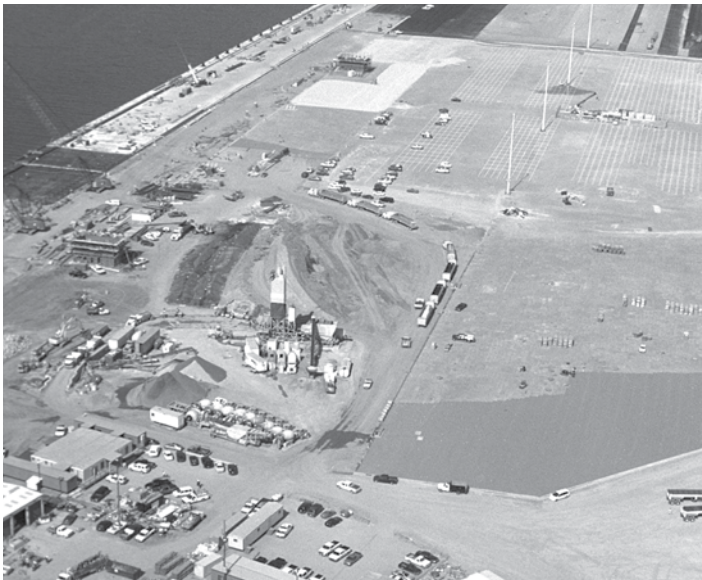
Figure 14. The Port of Oakland, California, is the largest mechanically installed project in the western hemisphere at 4.7 million sf (470,000 m 2 ).