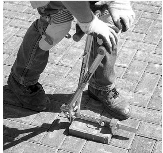
Figure 10. During initial compaction, cracked pavers are removed and immediately replaced with whole units.

brought into conformance with this specification as laying proceeds and prior to initial compaction. Sometimes the pattern may need to be changed to ensure that this can be achieved. However, specifiers should note that some patterns cannot be changed because of the paver shape and some paver cuts will need to be less than one-third.