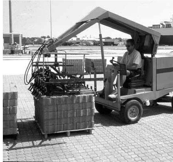
Figure 3. A cluster of pavers (or layer) is grabbed for placement by mechanical installation equipment. The pavers within the cluster are arranged in the final laying pattern as shown under the equipment.

Transportation planning for timely delivery of materials is a key element of large interlocking concrete pavement projects. Therefore, the manufacturer should include a