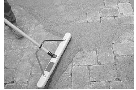
Figure 5. Joint sand can be pre-mixed and delivered to the site (typically in bags), or mixed with stabilizer at the site, then swept into the joints, compacted for consolidation in them to create interlock, and wetted to activate the stabilizer.

ment as a result of silts or other fines working their way into spaces between the sand particles. The rate of stabilization depends on the amount and sources of traffic, plus sources of fines that work their way into the joints from traffic over time.