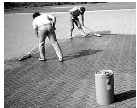
Figure 10. Urethane is applied with squeegees to stabilize joint sand between pavers on aircraft pavement.

Sealer should be spread and allowed to stand in the chamfers, soaking into the joints. Penetration