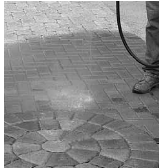
Figure 7. Dry-applied joint sand with a stabilizer is wetted in order to activate it and stiffen the sand. Once the joints dry, they are stabilized.

Stabilizers have been effective in securing joint sand in places subject to high winds such as in desert climates. They can prevent joint sand displacement from high-speed tire traffic. Like sealers, joint and stabilization materials reduce the potential for weeds and ants in the joints. In residential applications stabilization at downspouts and under eaves helps keep joint sand in place. Tumbled pavers (cobble stone-like units) and circular patterns have wider joints than other paver shapes. Tumbled pavers may require stabilized joint sand between them if they have slightly irregular sides and wide joints.