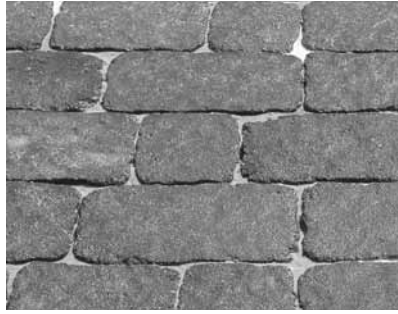
Figure 4. Liquid joint sand stabilizers can deepen the surface color slightly and they provide some surface sealing as well. Tumbled pavers shown here have wider joints than other shapes. These type of pavers can require stabilization of the joint sand.