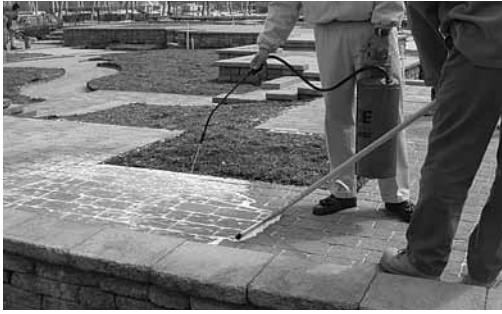
Figure 3. This liquid joint sand stabilizer is applied with a low-pressure sprayer and squeegeed across the surface after allowing some time for soaking into the joints. This helps maintain slip and skid resistance of the paver surface.