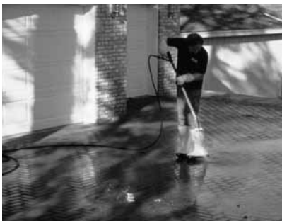
Figure 2. Pressurized cleaning equipment used by professional cleaning and sealing companies can bring out the best appearance from pavers.

Always refer to the paver supplier or chemical company supplying the chemicals for recommendations on proper dilution and application of chemicals for removal of efflorescence. They are generally applied in sections beginning at the top of slope of the pavement. If the area is large, a sprayer is an efficient means to apply the cleaner. The chemicals are scrubbed on