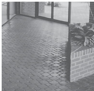
Figure 1. Many sealers enhance the appearance of concrete pavers and protect against staining.

Removal of several common stains from Removing Stains from Concrete are listed below (1). Most involve typical household chemicals. The information given is the best