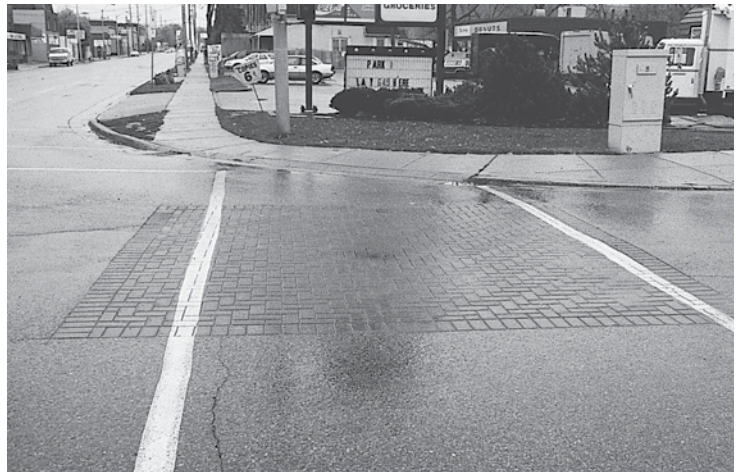
Figure 13. Concrete pavers in utility cuts can be painted as any other pavement.

lane, traffic, or crosswalk markings as any other concrete pavements (Figure 13).