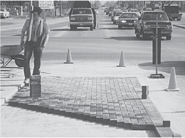
Figure 12. Pavers are laid in a 90 degree herringbone pattern between the border courses.