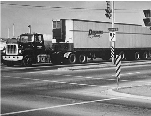
Figure 10. A patch of barely discernable pavers in a heavily trafficked intersection in London, Ontario

Spread, sweep and compact sand into the joints. The joint sand is typically finer than the bedding sand, and should conform to the grading requirements of ASTM C 144 (11) or CSA A179 (10). The joints must be completely full of sand after compaction. Remove excess sand and other debris. The pavers may be painted with the same