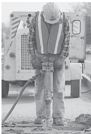
Figure 1. Repairs to utilities are a common sight in cities, incurring costs to cities and taxpayers.

The annual cost of utility cuts to cities is in the millions of dollars. These costs can be placed into three categories. First, there are the initial pavement cut and repair costs .