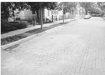
Figure 5. The final paver surface is continuous. There are no cuts or damage to the pavement.