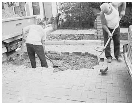
Figure 2. Removal of concrete pavers for a gas line repair in Dayton, Ohio.

Reducing User Costs— User costs due to traffic interruptions and delays