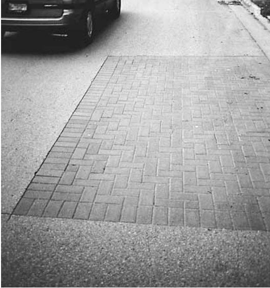
Figure 8. Utility cut repair in a residential area in London, Ontario.