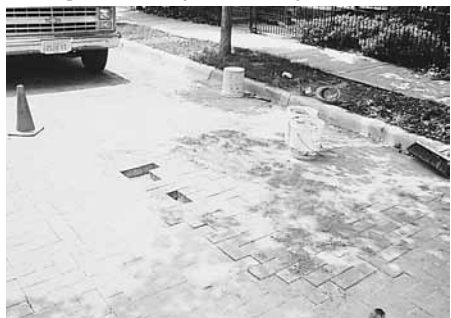
Figure 4. Reinstatement of the pavers, bedding and joint sand