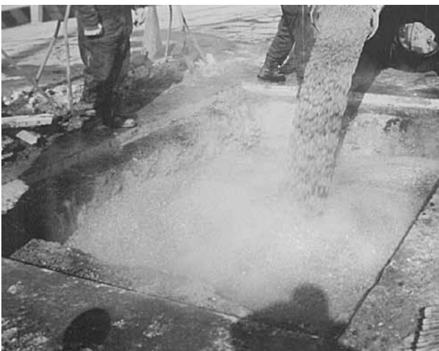
Figure 11. Low density concrete fill (unshrinkable fill) poured into a utility trench from a ready-mix concrete truck.