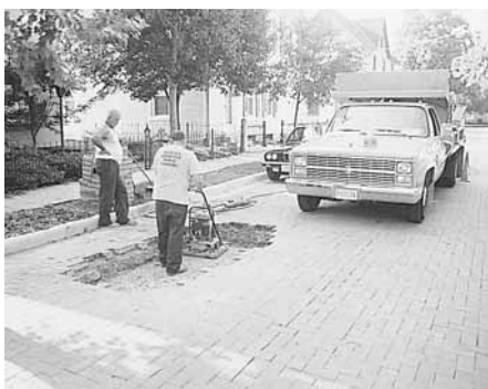
Figure 3. Compaction of the base