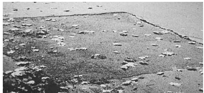
Figure 7. Pavement damage from settlement and shrinkage of cold patch asphalt.

Concrete pavers on low density concrete fill have been successfully used as a replacement for cold patch asphalt (Figures 8 and 9). They were first used as a temporary repair with the intent of being removed in the spring. However, the pavers performed so well that the City of London left them in place indefinitely. Several repairs were in streets subject to heavy truck traffic, as well as residential streets. Costs were less than using cold