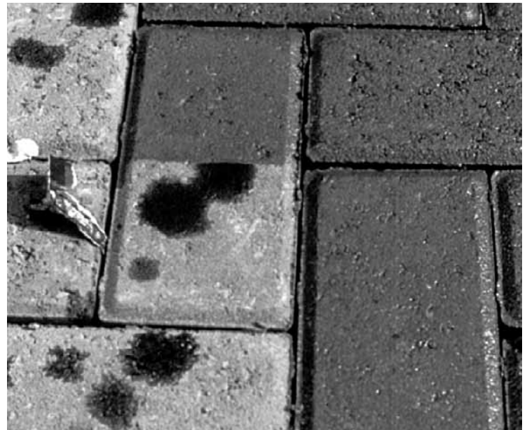
Figure 9. Sealers resist stains which makes them ideal for high use areas where they might occur.