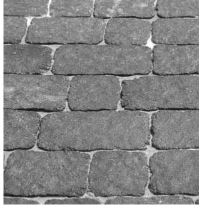
Figure 4. Liquid joint sand stabilizers can deepen the surface color slightly and they provide some surface sealing as well. Tumbled pavers shown here have wider joints than other shapes. These type of pavers can require stabilization of the joint sand.