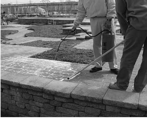
Figure 3. This liquid joint sand stabilizer is applied with a low-pressure sprayer and squeegeed across the surface after allowing some time for soaking into the joints. This helps maintain slip and skid resistance of the paver surface.