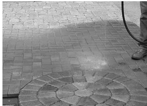
Figure 7. Dry-applied joint sand with a stabilizer is wetted in order to activate it and stiffen the sand. Once the joints dry, they are stabilized.