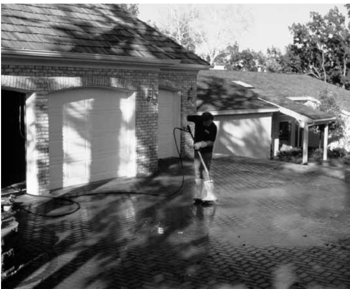
Figure 2. Pressurized cleaning equipment used by professional cleaning and sealing companies can bring out the best appearance from pavers.

If there is a need to remove deposits before they wear away, best results can be obtained by using a proprietary efflorescence remover. The acid in proprietary cleaning chemicals is buffered and blended with other chemicals to provide effective cleaning without damage to the paver surface. Always refer to the paver supplier or chemical company supplying the chemicals for recommendations on proper dilution and application of chemicals for removal of efflorescence. They are generally applied in sections beginning at the top of slope of the pavement. If the area