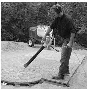
Figure 6. Whether using liquid or dry joint stabilization materials, the surface of the pavers should be cleaned with a blower or broom after the joint sand is compacted into the joints.

Joint sand gradation can affect the depth of penetration of the liquid stabilizer. The amount of fines or material passing the No. 200 (0.075 mm sieve) can influence the depth of penetration. A joint sand gradation with less than 5% passing the No. 200 (0.075 mm) sieve can allow better penetration of liquid stabilizers. A job site mock-up