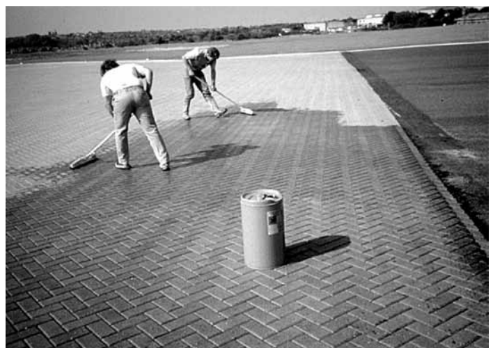
Figure 10. Urethane is applied with squeegees to stabilize joint sand between pavers on aircraft pavement.

Cover and protect all surfaces and vegetation around the area to be sealed. For exterior (low-pressure) sprayed applications, the wind should be calm so that it does not cause an uneven application, or blow the sealer onto other surfaces. For many sealers, especially those with high VOC's, wear protective clothing and mask recommended by the sealer manufacturer to protect the lungs and eyes.