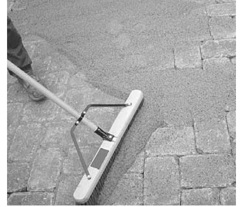
Figure 5. Joint sand can be pre-mixed and delivered to the site (typically in bags), or mixed with stabilizer at the site, then swept into the joints, compacted for consolidation in them to create interlock, and wetted to activate the stabilizer.

There are some applications where early stabilization of the joints is important to maintaining functional performance of the paver surface. For example, stabilization is recommended on high slope applications over 7% and on applications where the slope is less than 1.5%. Applications on high slopes will help prevent wash-out of joint sand. Stabilizers in very low slope or flat areas can help reduce infiltration of standing water.