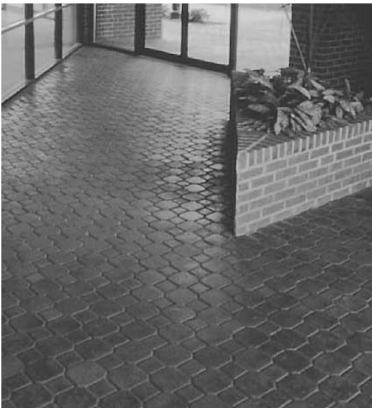
Figure 1. Many sealers enhance the appearance of concrete pavers and protect against staining.

Stains on specific areas should be removed first. A cleaner should be used next to remove any efflorescence and dirt from the entire pavement. A newly cleaned pavement can be an opportune time to apply joint sand stabilizers or seal it. In order to achieve maximum results, use stain removers, cleaners, joint sand stabilizers, and sealers specifically for concrete pavers. These may be purchased from a manufacturer, contractor, dealer or associate member of the Interlocking Concrete Pavement Institute.