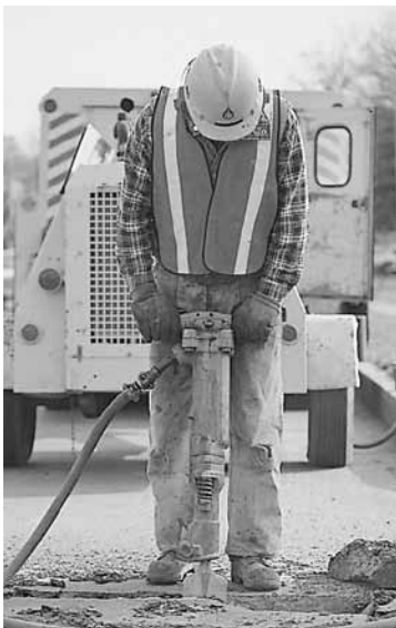
Figure 1. Repairs to utilities are a common sight in cities, incurring costs to cities and taxpayers.

A 1985 study in Burlington, Vermont, demonstrated that pavements with patches from utility cuts required resurfacing more often than streets without patches. Pavement life was shortened by factors ranging between 1.70 and 2.53, or 41% to 60% (2). Research in Santa Monica, California, showed that streets with utility cuts saw an average decrease in life by a factor of 2.75, or 64% (3). A 1994 study by the City of