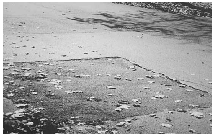
Figure 7. Pavement damage from settlement and shrinkage of cold patch asphalt.

All repairs in London with concrete pavers and low-density concrete have produced a smooth surface transition from the asphalt to the pavers. The riding