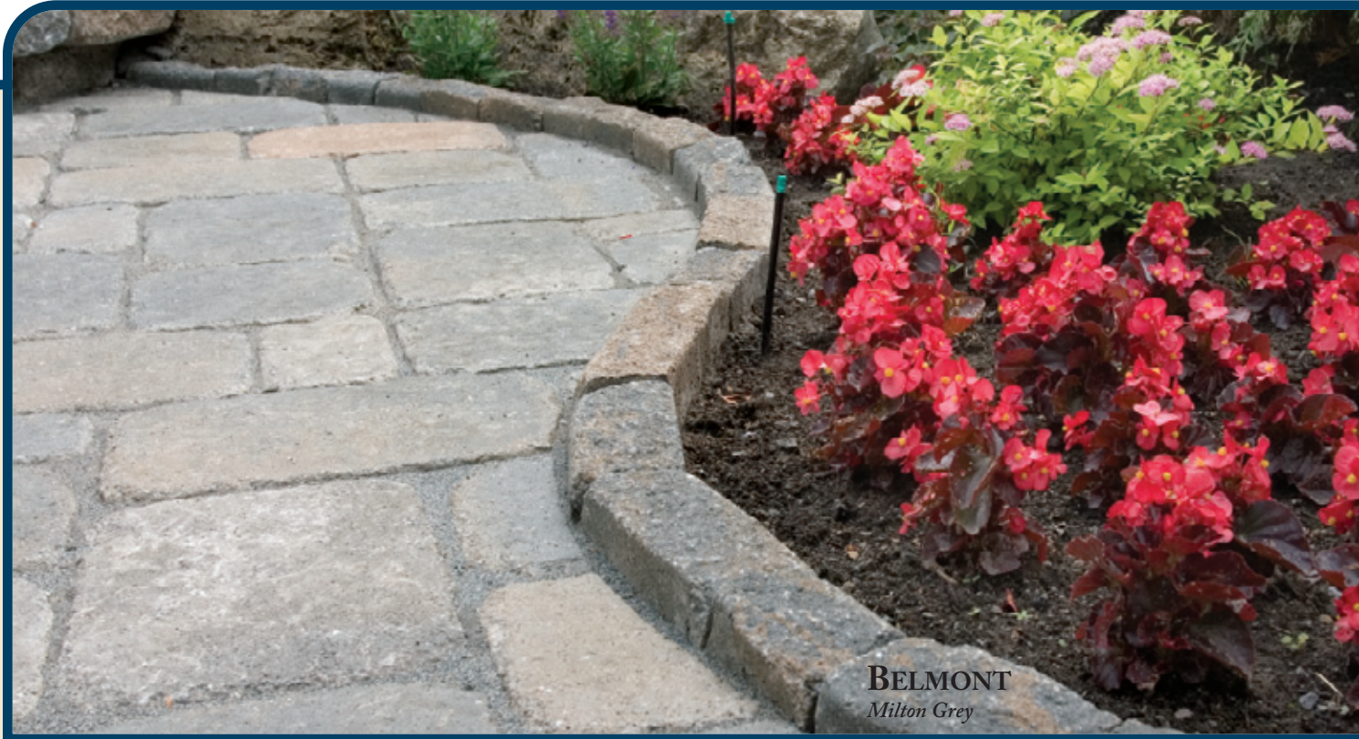
BELMONT Milton Grey

Our Belmont Border stone adds a decorative finishing touch to your walkway and provides a clean, crisp definition to garden plots. It's perfect for keeping soil and mulch in and grass out of well-tended flower beds and other landscaped areas.