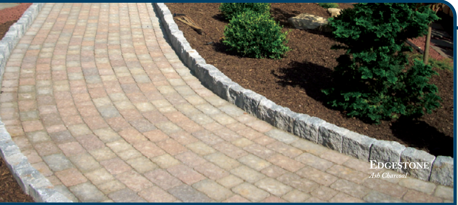
EDGESTONE Ash Charcoal