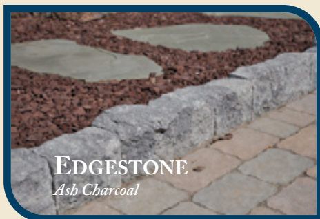
EDGESTONE Ash Charcoal

Available in select regions only. Please check with your local supplier.