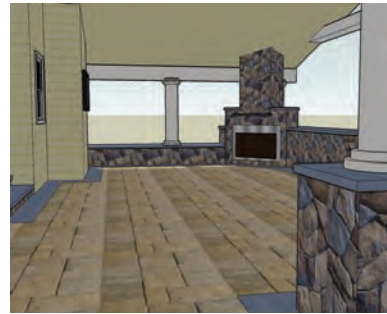
This outdoor living area brings all the modern conveniences of home outdoors, including a flat-screen TV and fireplace.