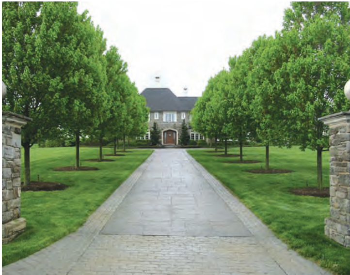
An affordable choice among many decorative paving materials, imprinted concrete combines an impressive high-end look with low maintenance, durability and longevity.

system that uses special imprinted products to create decoratively stamped asphalt driveways.