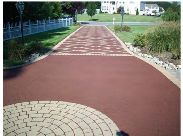
A standard scallop finish separated by a stacked brick border and a full-size medallion centered in front of the garage makes a welcoming impression.

Concrete paving stones offer homeowners a durable alternative that resists cracking caused from frequent freeze-thaw cycles and adds value to the home. Looking for something vibrantly-colored?