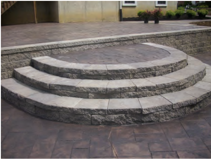
Steps leading to a backyard patio are created using stamped concrete with a natural stone border.