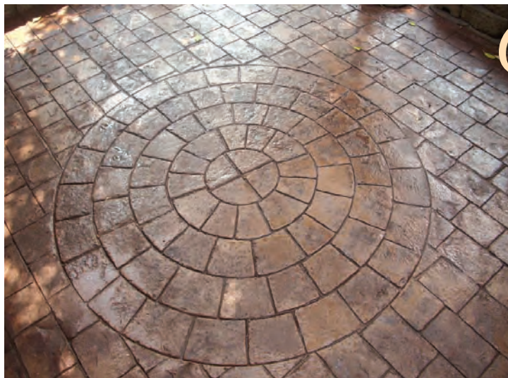
Top: Step into a world of tranquility when you step onto the concrete pavers surrounding this dream-like backyard pool.