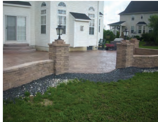
This spacious patio, constructed of stamped concrete, leaves the homeowners plenty of room for entertaining and enjoying the outdoors.