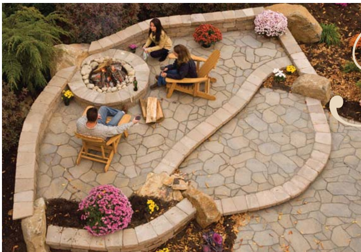
Top: Palazzo Modulo pavers in Milton grey add the look of randomly installed stones to this patio and outdoor kitchen.

Rinox materials have been used everywhere from the retaining walls and permeable walkways of commercial properties like the Upland Square Shopping Center in West Pottsgrove, PA, to pool